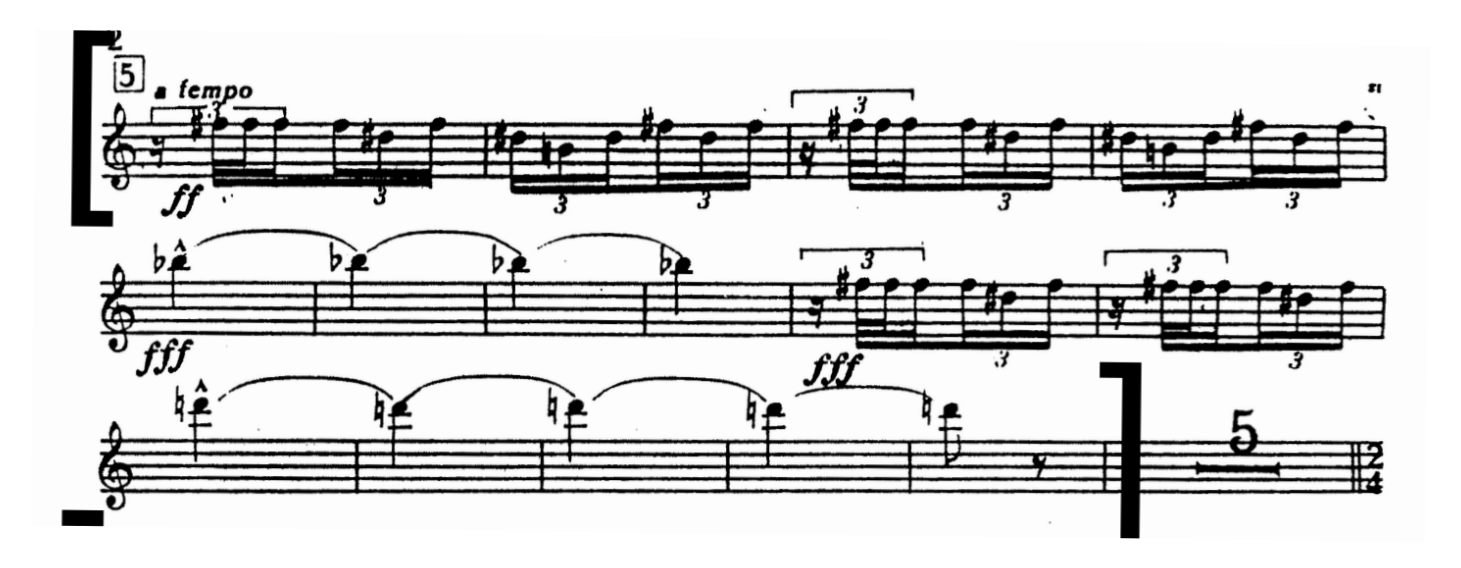
Excerpt 3 RESPIGHI: Pines of Rome, I. The Pines of the Villa Borghese, Oboe Allegretto vivace , time signature: 2/8 – Trumpet in B-flat

RESPIGHI: Pines of Rome, I. The Pines of the Villa Borghese, Oboe Allegretto vivace , time signature: 2/8 – Trumpet in B-flat