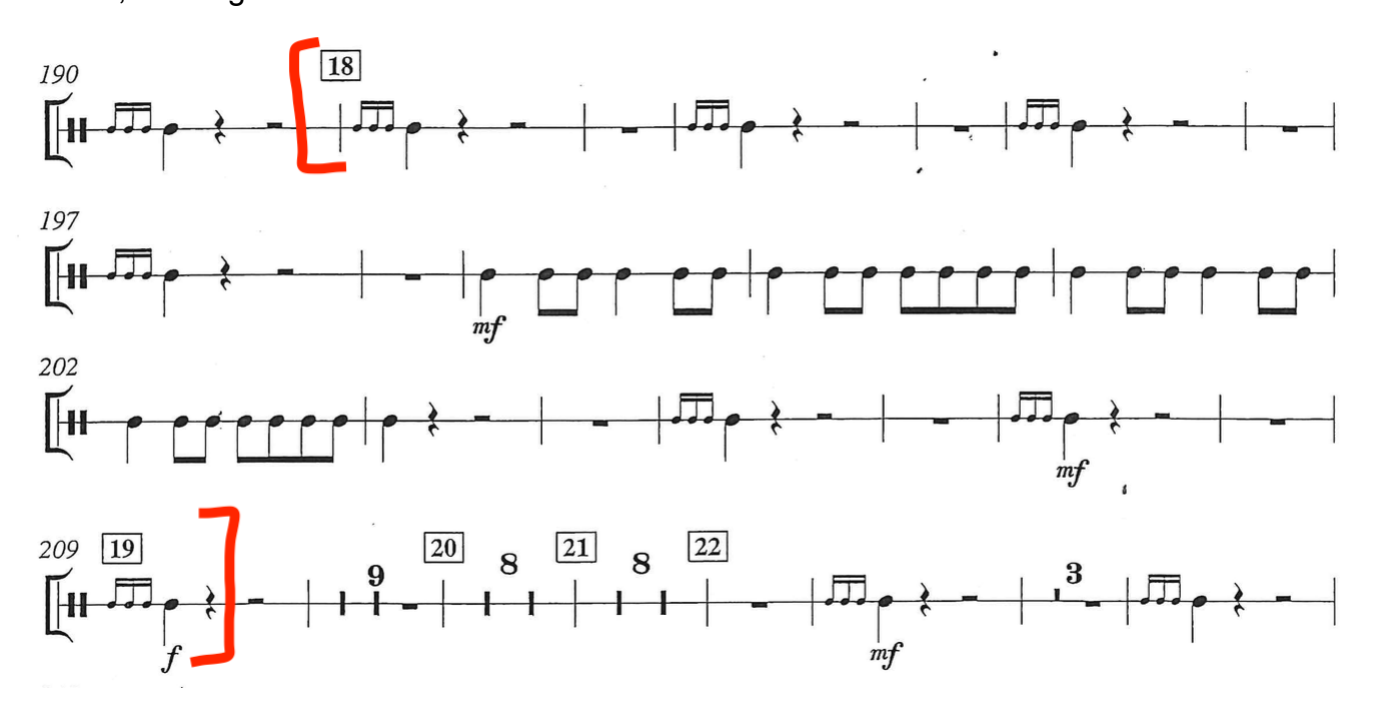
Page 1 of 4

Presto, time signature: 2/2 - Snare Drum